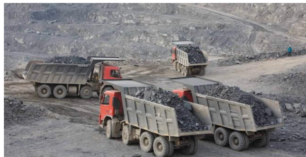
Fig :1. Open cast mining and dumping

The magnitude of environmental damage caused by mining is visible in all stages of mining operations starting from exploration of minerals and continuous up to mineral beneficiation. If the adverse effects have to be enlisted, they may be umpteen like damage to landscape and topography by opencast mining and dumping (Fig.1), loss of productive land and property by underground mining, ecological imbalance due to topographic alterations, disrupted drainage patterns and dumped streams and lakes, pollution of water sources, adverse effect on the water table, various health hazards, loss of greenery, tremors during blasting leading to injuries, disturbed quality of air due to release of pollutants and many other adverse effects. But harmony can be maintained between mining and environmental protection if a geologist carefully plans all the operations. The geologist has to decide the final usage of the land after mining to make mining as a means of reclamation.